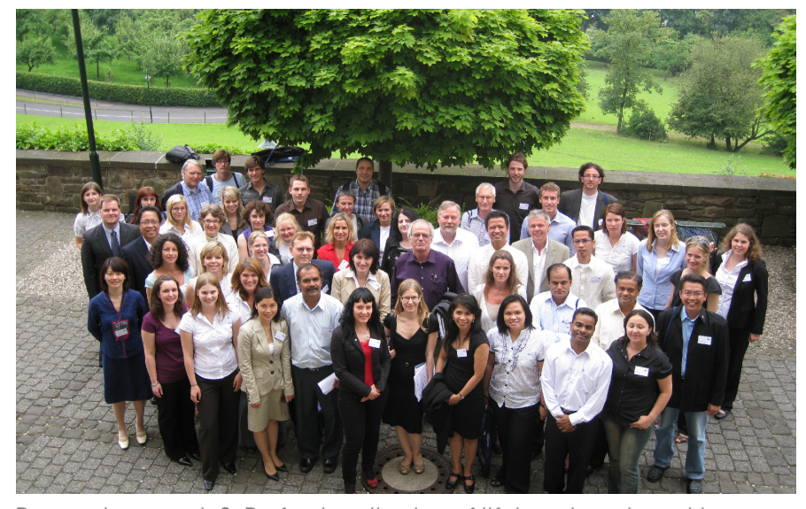
Research network 3: Professionalisation of lifelong learning with special emphasis on teacher training

The conference was organised by the German Institute for Adult Education in co-operation with the ASEM LLL Hub.